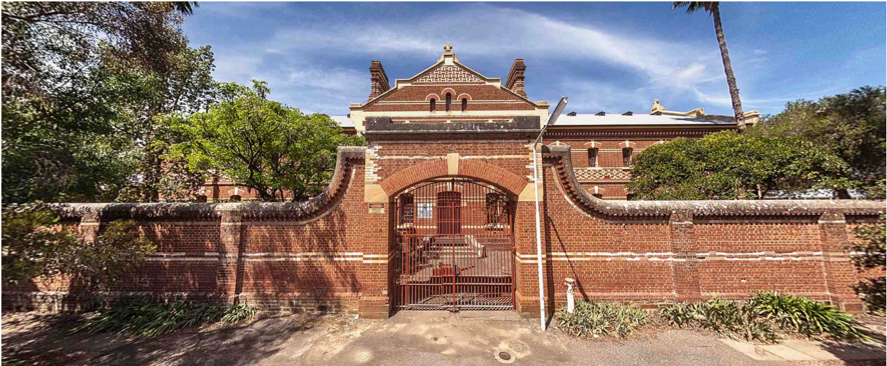
Gates to Z-Ward : Prison for the Criminally Insane - Adelaide, South Australia