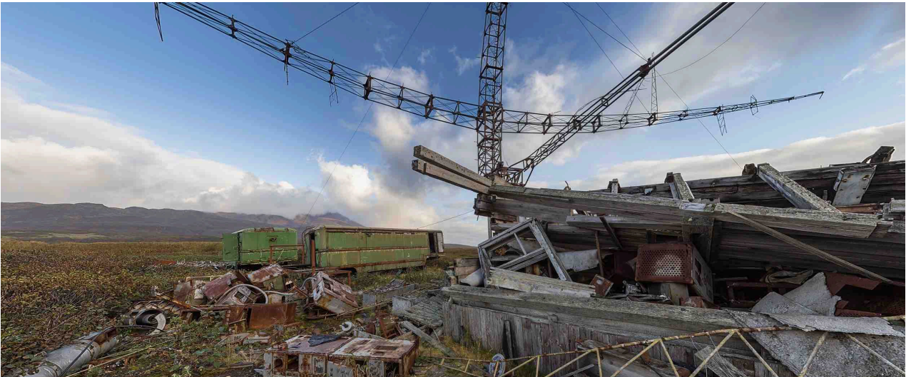
Radar Installation : Abandoned Military base - Matua Island, Sea of Oshkosh