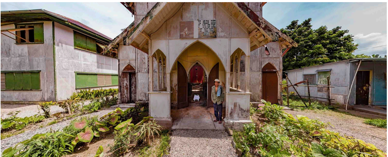
Historic Anglican Church - Samari Island, Papua New Guinea

Visting a historic church on the islands of Papua New Guinea to an abandoned WWII military installation in the Kuril Islands and exploring remnants of institutions past, such as Z-Ward, and timely reminders of our frailty the Torrens Island Quarantine Station, the desire to document, preserve and share these experiences has been rewarding and is ongoing.